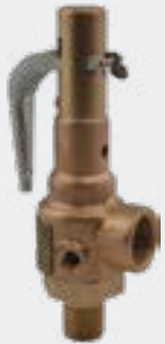
Bronze Safety Relief Valves

Safety and safety relief valves. ASME Sections I, IV and VIII. Brass, bronze, cast iron, carbon steel and stainless steel bodies. Available in inlet sizes 1/4" through 6". Certified for steam, air/gas, and liquid service with set pressures up to 900 psi.