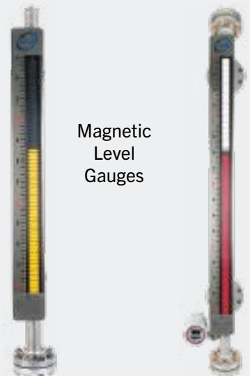
Magnetic Level Gauges

Jogler magnetic level gauges are a safe, economical way to measure and control level through a wide range of process pressures, temperatures, and fluids. Each component (chamber, float, and indicator) has been engineered to improve on existing designs to ensure reliable, maintenance-free operation right out of the crate.