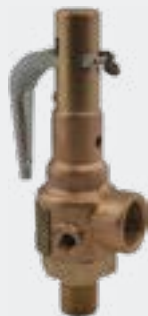
Bronze Safety Relief Valves

Safety and safety relief valves. ASME Sections I, IV and VIII. Brass, bronze, cast iron, carbon steel and stainless steel bodies. Available in inlet sizes 1/4" through 6". Certified for steam, air/gas, and liquid service with set pressures up to 900 psi.