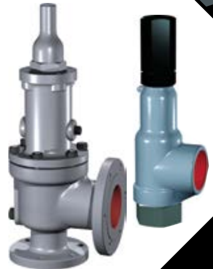
Safety Relief Valves