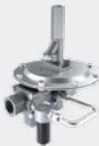
Pilot Operated Tank Blanketing Valves