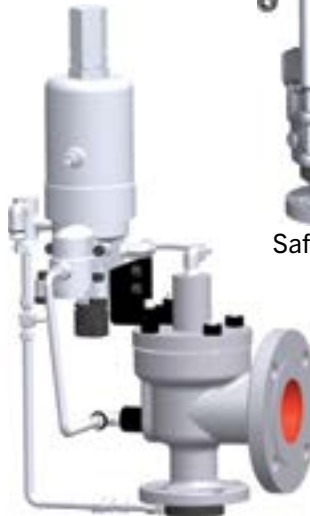
Pilot-Operated Safety Relief Valves