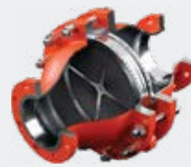
In-Line Deflagration Flame Arrester