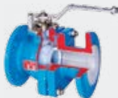
Lined Ball Valves