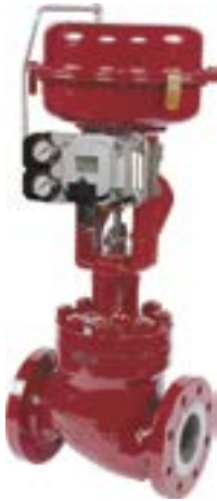
Globe Control Valves