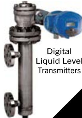
Digital Liquid Level Transmitters