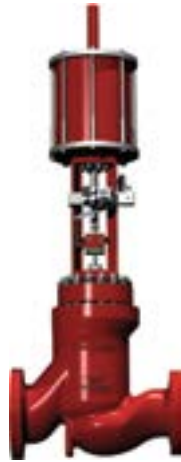
Severe Service (V-LOG Anti-Cavitation)