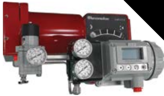
Camflex Rotary Control Valves / SVI3 Smart Valve Positioners