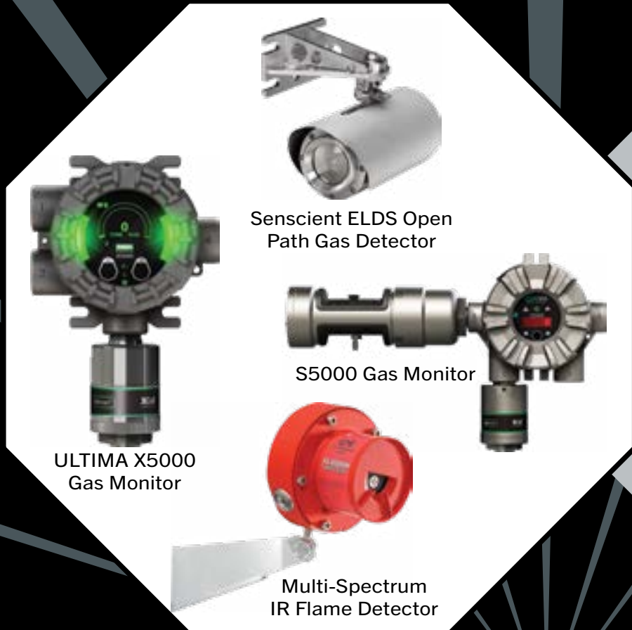
Senscient ELDS Open Path Gas Detector